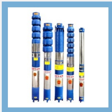
Bore Well Submersible Pump