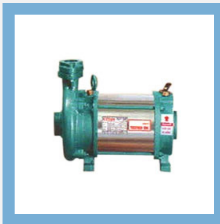
Open Well Horizontal Monoset Pumps