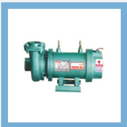
Horizontal Monoset Pumps