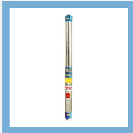
Submersible Water Pumps