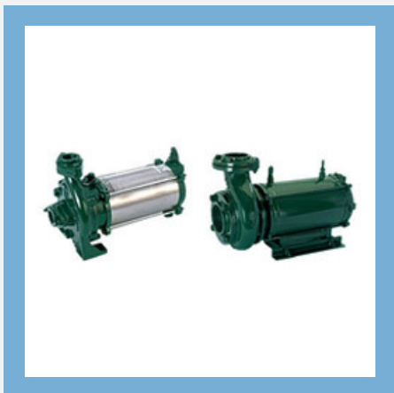
Horizontal Open Well Submersible Pumps